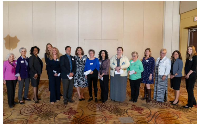
Women's Giving Circle members and grant recipients at YCF's 2023 Grant Award Celebration

Grant funding will help remove barriers to acquiring adequate supplies for menstrual health to distribute discreetly and at no cost to female patrons.